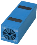
RM PPS module with Multidiameter™